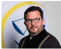
Judge Guénaél Mettraux