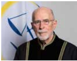
Judge Charles Smith III (Presiding Judge)