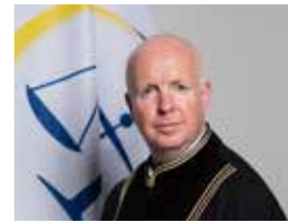
Judge Fergal Gaynor (Reserve Judge)