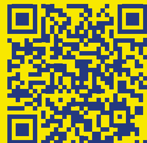
KSC Youtube channel