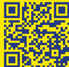
KSC Instagram channel